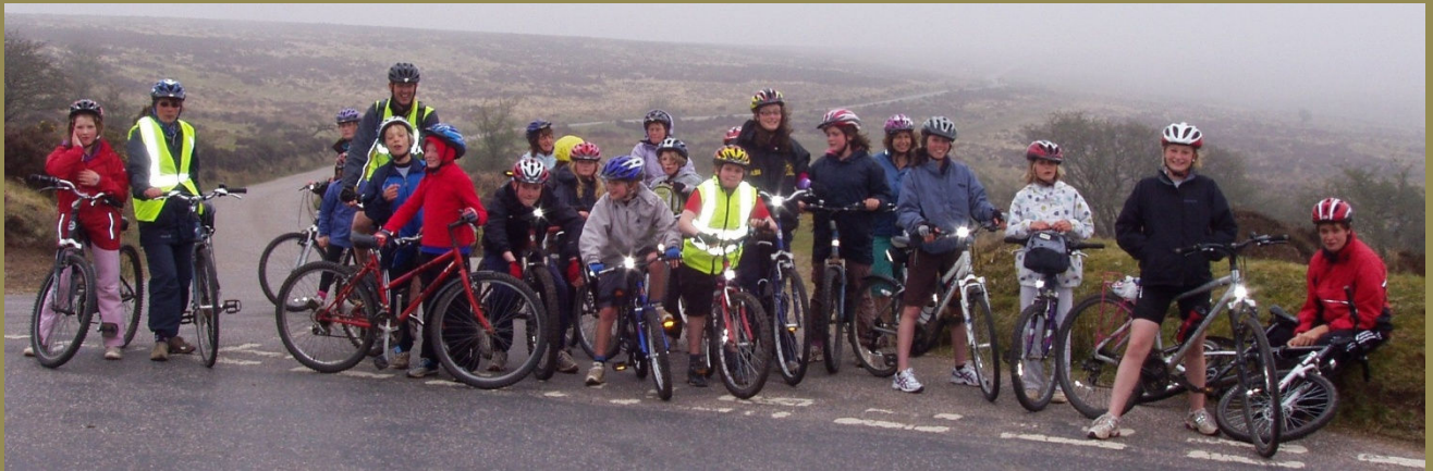
The Mill South Molton 15&16 April 2009

Thirty-two riders, bags packed and loaded in Ian’s Landrover gathered at Kentisbeare Village Hall for KJCC’s big ride to The Mill adventure centre at South Molton. This ride, 80 miles in total and the club’s first to cross the 1,000ft contour, would include a summit cake stop at 1,200ft in the whirling mist of Anstey Common on Exmoor.