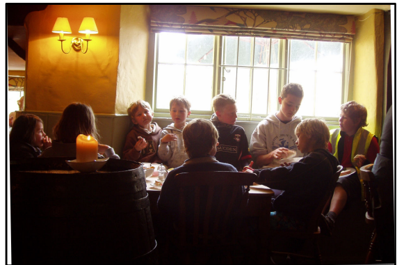
Stag Inn Rackenford